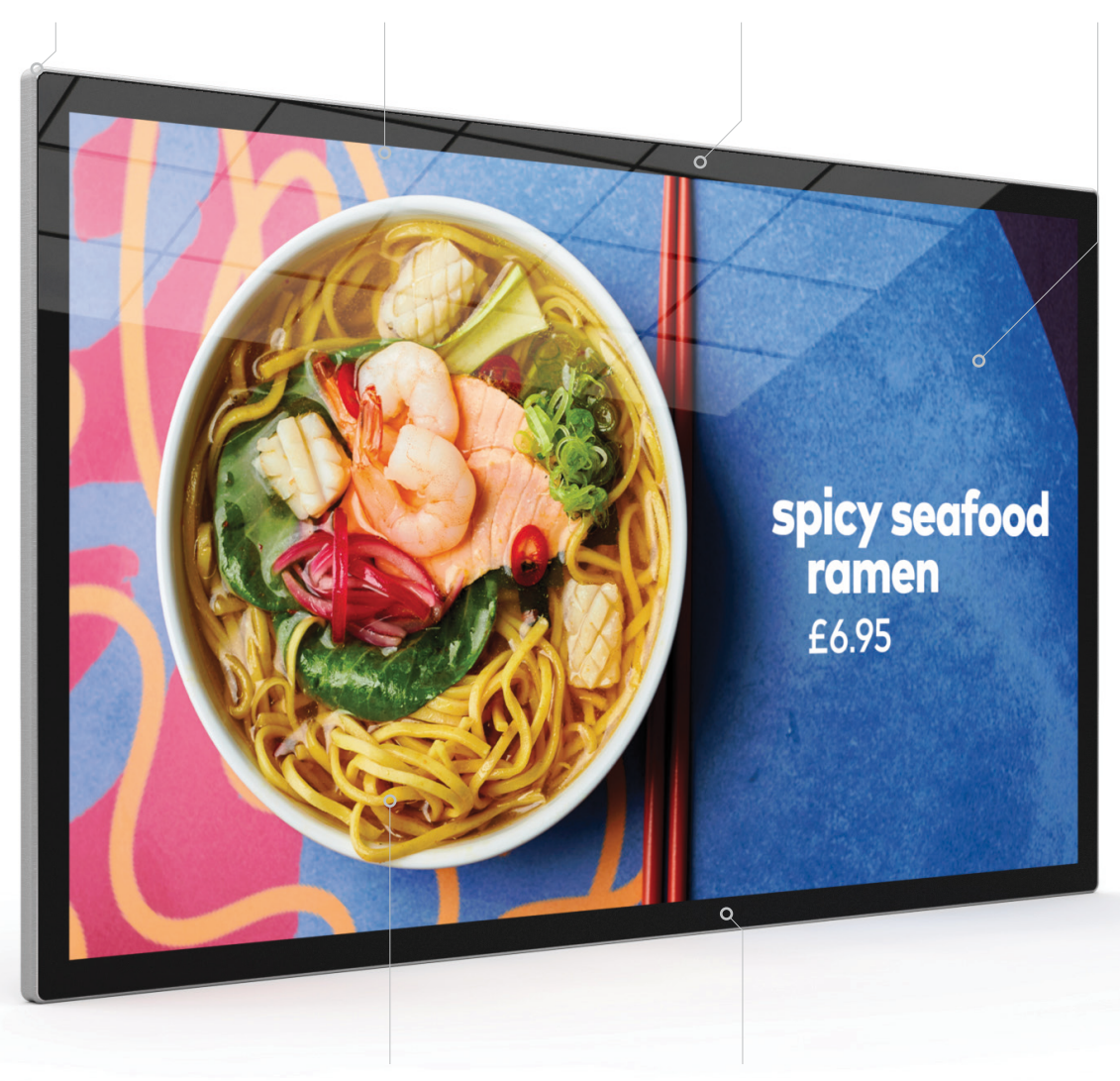
LANDSCAPE OR PORTRAIT ORIENTATION